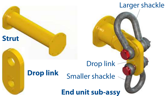
Table 1 – Component List