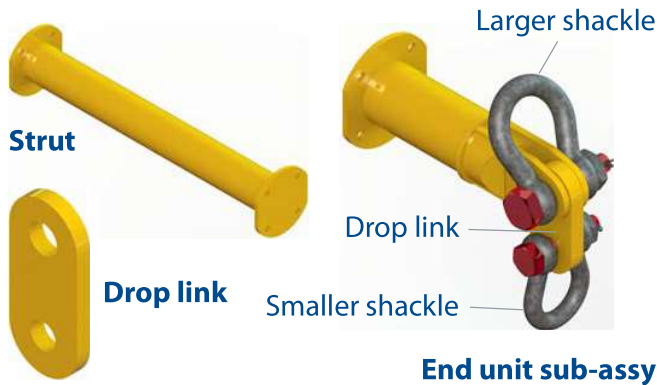
Table 1 – Component List